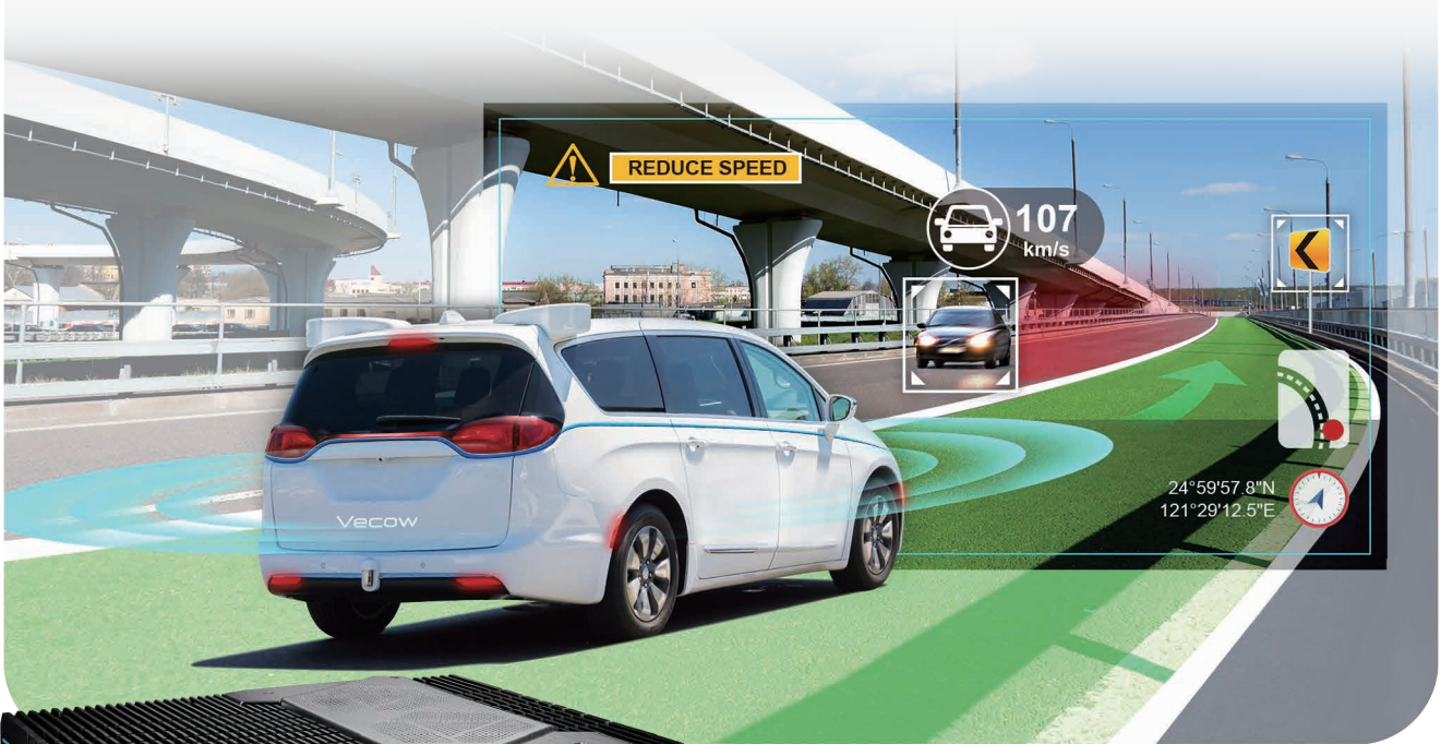
▲ Traffic Vision

AI Computing System with NVIDIA® Tesla®/Quadro®/GeForce® Graphics